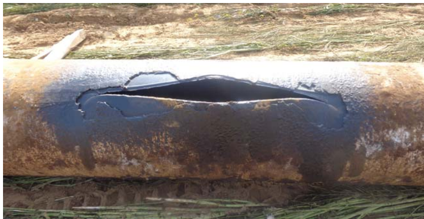
Fish mouth opening of the crude oil line at 12 to 1 O'clock position

The pic below depicts the fish mouth opening of the pipe between 12 to 1 o'clock position near HAZ of the weld seam. The dimensions of the ruptured pipe are L=1.080 mm; maximum opening in the middle of rupture ~14 mm; metallurgy of pipe LSAW 22" OD, 0.25" WT, API 5L-X-65 grade; provided with Coal Tar Enamel (CTE) coating.