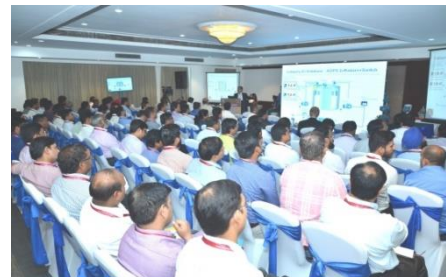
DELEGATES CAREFULLY GOING THROUGH THE PRESENTATION ON DESIGN & INSTALLATION OF TANK LEVEL GAUGE

Also explained that with implementation of MBLCR recommendations at POL locations, the complexity of operations is enhanced manifold and overall safety system of the locations is strengthened w.r.t in built design, real time data monitoring, detection & early alarm system and up-gradation of fire fighting system. He also said that though MBLR implementation is 100 % but w.r.t its functionality, it has been reported 80%. He concluded his address saying that “Safety is not a choice but an integral part of our operations”.