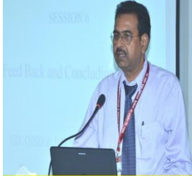
DIRECTOR (MO)-OISD is giving vote of thanks to OMCs, all associates for all co-operation

At the end, Director-MO OISD delivered the formal vote of thanks and express gratitude to OIL PSUs officers who extended whole hearted support to make it a grand success at Indore.