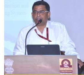
Joint Director (MO)-POL is concluding 2 days workshop on 16.6.17

Joint Director -MO-POL OISD concluded the programme.