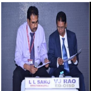
Analysis of Feedback