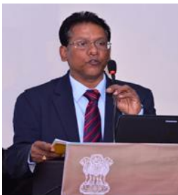
Welcome address by ED, OISD

ED, OISD in his keynote address explained the importance of inbuilt Design safety by quoting two specific examples, one being the grip of tyre which provides safety for the travellers and another one is the rear reflector on bicycle which prevents accident on road. He cited the recent Budge Budge incident; a case of complete disregard to SOP.