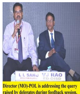
Director (MO)-POL is addressing the query raised by delegates during feedback session.